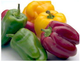
Promoting healthy eating, both naturally and spiritually.

The Daniel Fast is a very healthy way to eat and is full of nutritious and healthy foods.